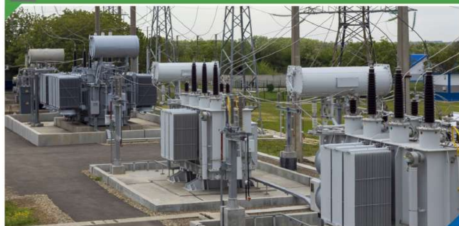
On Transformer's Abnormal Situation (Part-30)