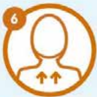
Stiff neck / back / muscles