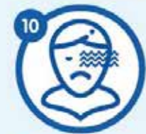
Visual aura, e.g. flashing lights

Send us your feedback on: corpcomm@ieema.org