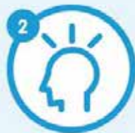
Severe head pain